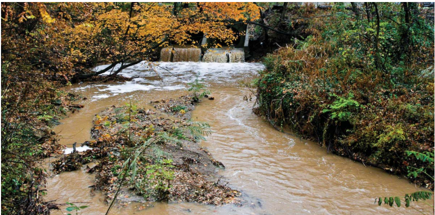
River des Peres.

While spreading methods vary by plant, some invaders can travel by attaching to a hiker's boot. Some are windblown, while others are spread by birds that eat their fruits. Many of the invasive species in this brochure threaten watersheds and can travel in floodwaters.